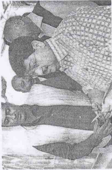
नगर निगम के अस्पताल का उद्घाटन करते सांसद परिमल नथवानी।

नथवानी ने किया खुलासा, ऐसा होता तो आधुनिक चिकित्सा उपकरण लगते, मरीजों का भला होता